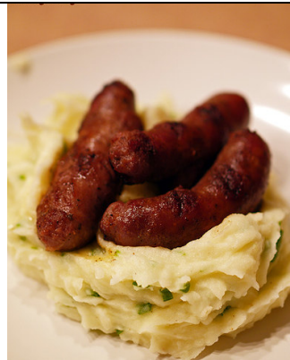
Bangers and mash , also known as sausages and mash, is a traditional English dish made of mashed potatoes and sausages,